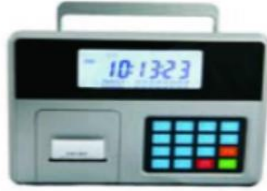
Wireless indicator CII Indicator