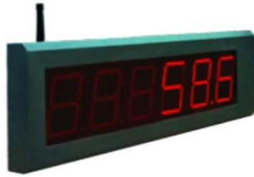
Optional 5-inch wired / wireless screen