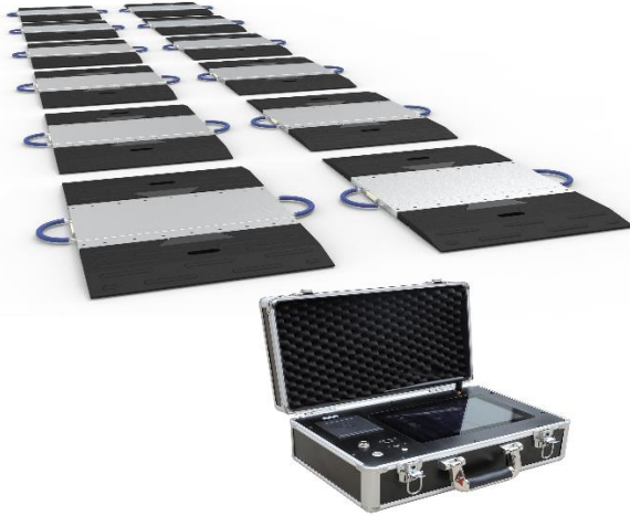
Portable Axle Weigher (K series integrated type)