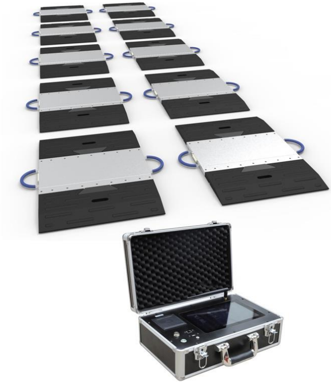
Portable Axle Weigher (K series integrated type)